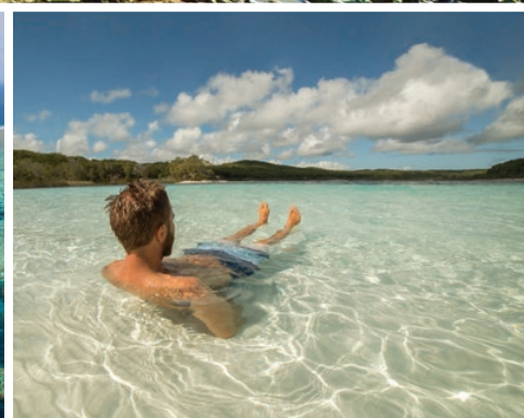
Visit world heritage-listed K'gari (Fraser Island), the world's largest sand island