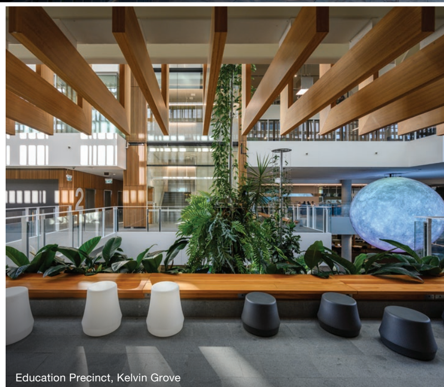
Education Precinct, Kelvin Grove