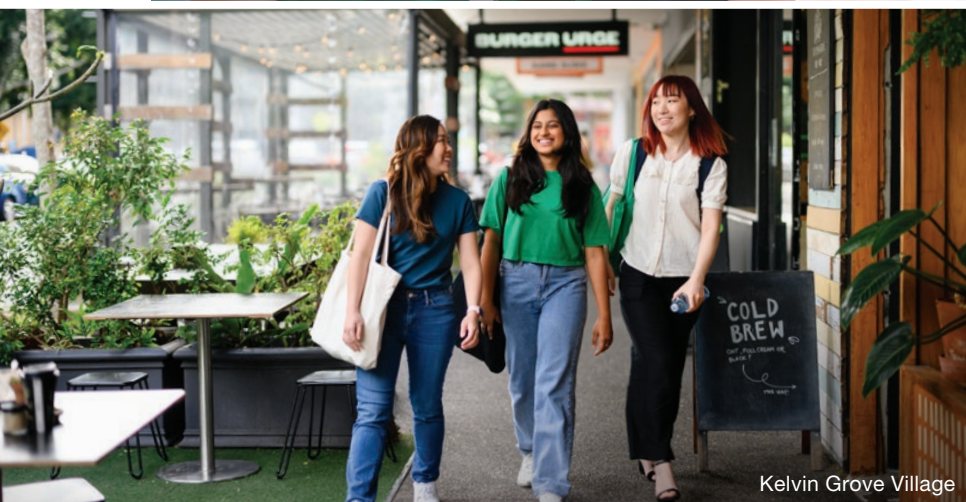
Kelvin Grove Village