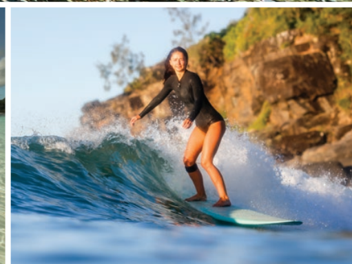
Discover Queensland's iconic Gold Coast and Sunshine coast beaches