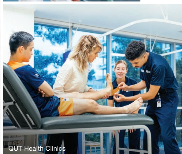
QUT Health Clinics