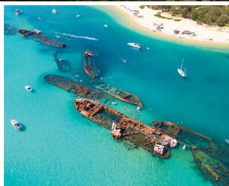
Escape to Mulgumpin (Moreton Island) or Minjerribah (North Stradbroke Island) for the weekend with your mates