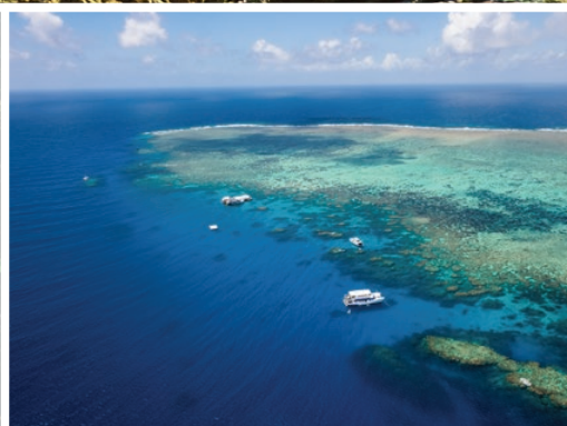
Snorkel on the Great Barrier Reef, a world heritage-listed natural wonder