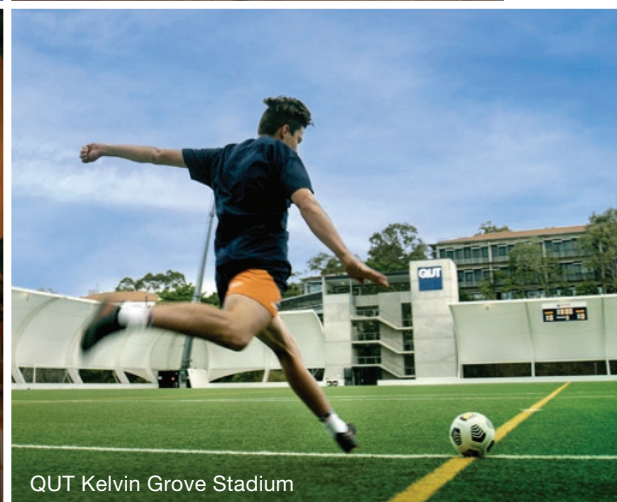
QUT Kelvin Grove Stadium