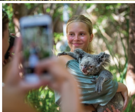
Cuddle a koala at Lone Pine Koala Sanctuary or Australia Zoo