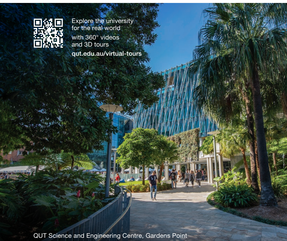
QUT Science and Engineering Centre, Gardens Point

Explore the university for the real world with 360° videos and 3D tours qut.edu.au/virtual-tours