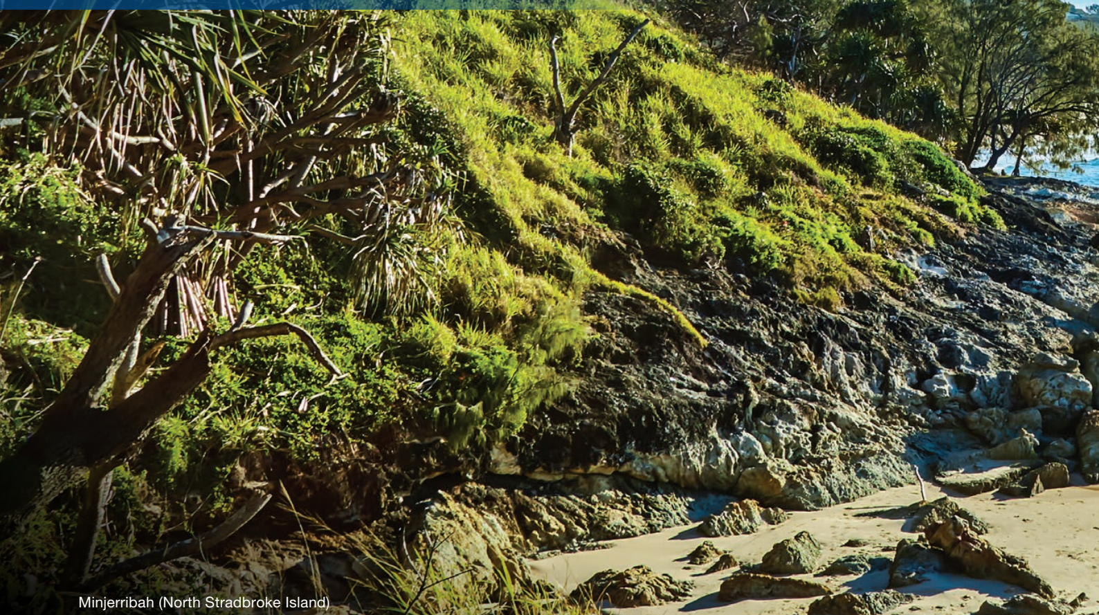
Minjerribah (North Stradbroke Island)

as World Heritage rainforests, pristine beaches, charming islands and unique wildlife.